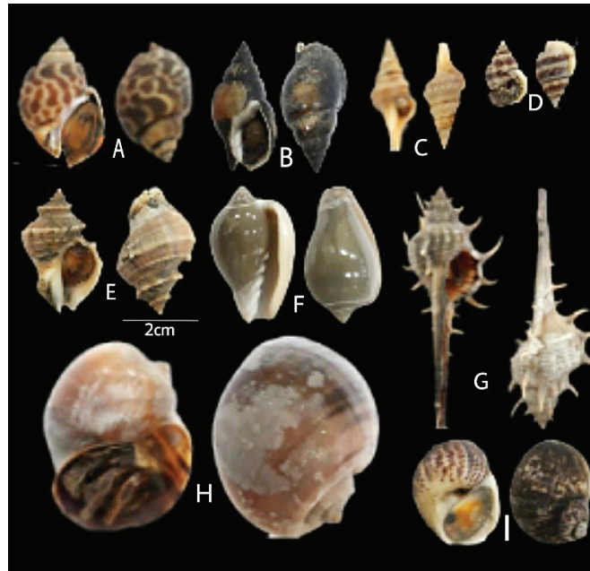
Figure 2. Gastropods species in Sedati Waters

of the case (Baharuddin and Zakaria, 2018). The basic forms of gastropod shells have three, namely conical, spiral, and Planospiral (Pyron and Brown, 2015). The gastropod shells are several parts that can be used as identification keys, and those parts are the apex, body whorl, spire, columella, umbilicus and aperture (Sturm et al., 2006). The gastropods with spiral shell forms, such as Babylonia spirata , Nassarius olivaceus , Turricula javana , Nassarius stolatus , Rapana venosa and Cryptospira ventricosa , are dominant.