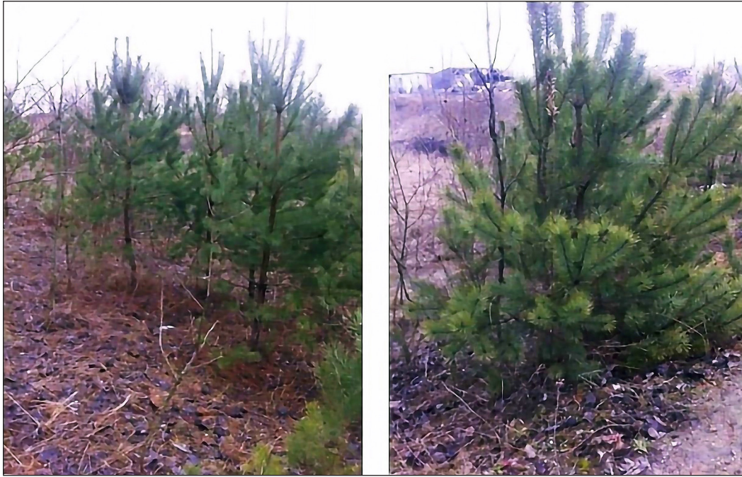
Figure 4. Natural regeneration of Pinus sylvestris L. 100 m from the landfill

The phytomeliorative efficiency of vegetation at solid waste landfills shows that the surface of landfills in the Western Forest Steppe is dominated by stunted plants and the phytomelioration coefficient is low. Thus, the surface of the landfill is suitable for phytomelioration and reclamation works and landfill decommissioning. The phytomeliorative efficiency of vegetation at solid waste landfills shows that the surface of landfills in the Western Forest Steppe is dominated by stunted plants and the phytomelioration coefficient is low. Thus, the surface of the landfill is suitable for phytomelioration and reclamation works and landfill decommissioning.