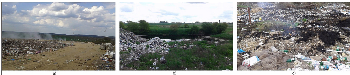
Figure 3. Natural phytomelioration and the process of landfill combustion: (a) Ternopil; (b) Tysmynets; (c) Sokal

surface heterogeneity (there are the following parts: the top, from where the washing of small particles and nutrients occurs, the transit zone: the slopes along which small particles are transported to the foot of the dump and the so-called accumulative zone, where substances washed from the top accumulate and create favourable conditions for the vegetation development).