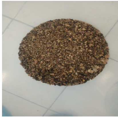
Milled cocoa shells