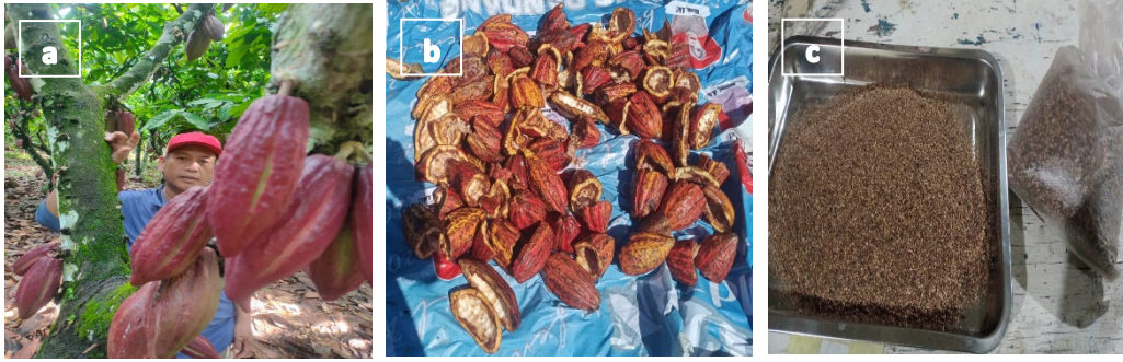
Figure 1. Cocoa ( Theobroma cacao L.). a Cocoa fruit harvesting. b Drying of cocoa pod husks. c Cocoa pod husk powder