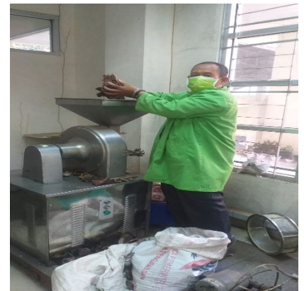
Process of crushing cocoa shells