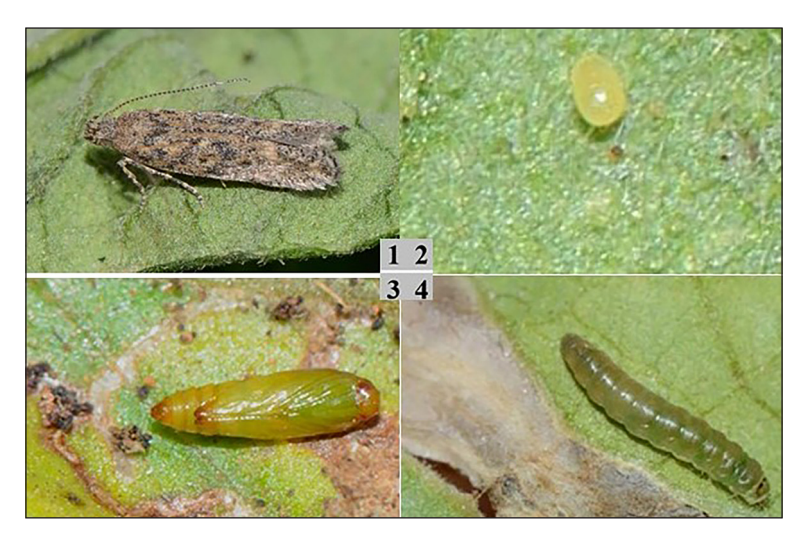
Figure 1. T. absoluta: 1 – adult insect; 2 – egg; 3 – pupa; 4 – larva [Borzykh, et al., 2009]

potatoes, eggplants, nightshades, belladonna, dahlia and other decorative nightshades. This pest is often called the passing moth, because the larvae damage the leaves, stems and fruits of vegetable crops, depositing waste products there like a "mine" [Movchan, et al. , 2016] (Figure 2).