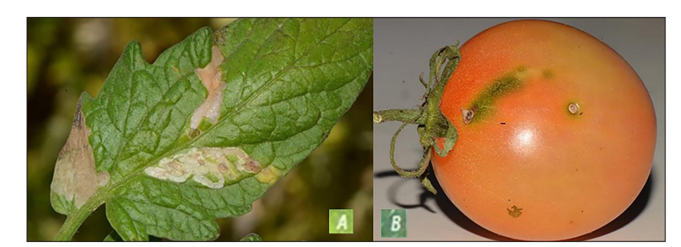
Figure 2. A – a mine on a leaf, B – damage to the fruit by goose T. absoluta [Movchan, et al., 2016]

Areas with a warm climate and mild, frostfree winters are optimal for long-term survival of the tomato moth. The degree of suitability decreases from south to north. Regions with a hot, dry climate (the equatorial part of Africa and the continental part of Australia, and a cold climate with frosty long winters (the northern part of Eurasia and North America) are unsuitable for the pest to inhabit [Venette, and Morey, 2020]. To prevent harmful effects on the environment