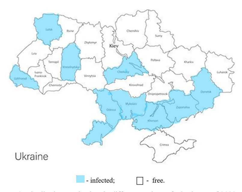
Figure 4. Distribution T. absoluta in different regions of Ukraine as of 2023 year

In the Volyn region, the pest is registered in the Volodymyr-Volyn district on an area of 10 ha. In Zakarpattia Oblast, 11.4 ha were infected in Berehiv and Uzhgorod districts. The area of infection in the Zaporizhia region amounted to 248.06 ha in the Berdyansk, Zaporizhia, Vasylivskyi, Melitopol and Pologivsky districts on the area, respectively 79.24, 65.79, 32.00, 43.20 and 27.80